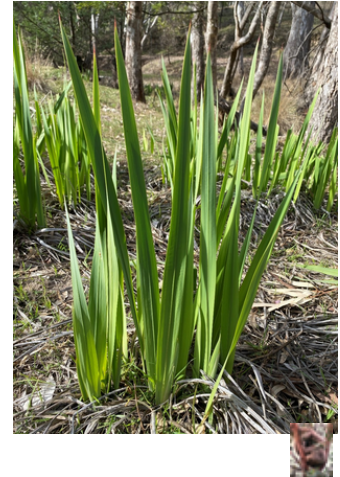
Photo: Watsonia weed along the Hughes Creek at Tarcombe will be controlled.