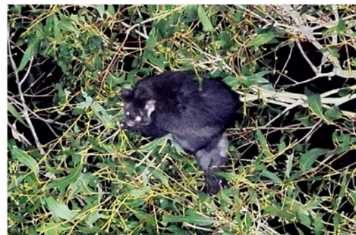
Southern Greater Glider detected by thermal camera and drone, Caveat Forest

RSVP: Sam 0417 576 306, Bert 0409 433 276