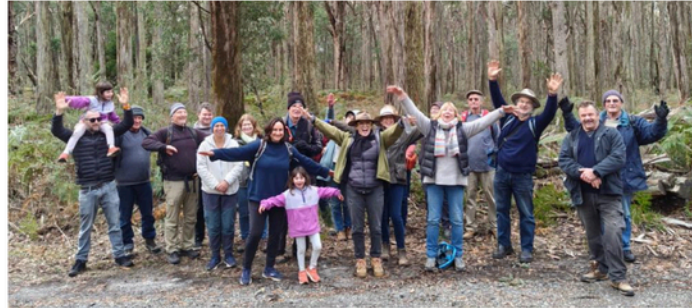
Would-be gliders in the Caveat Forest!

RSVP numbers and dietary prefs: text Bert – 0409 433 276, or Sam – 0417 576 30