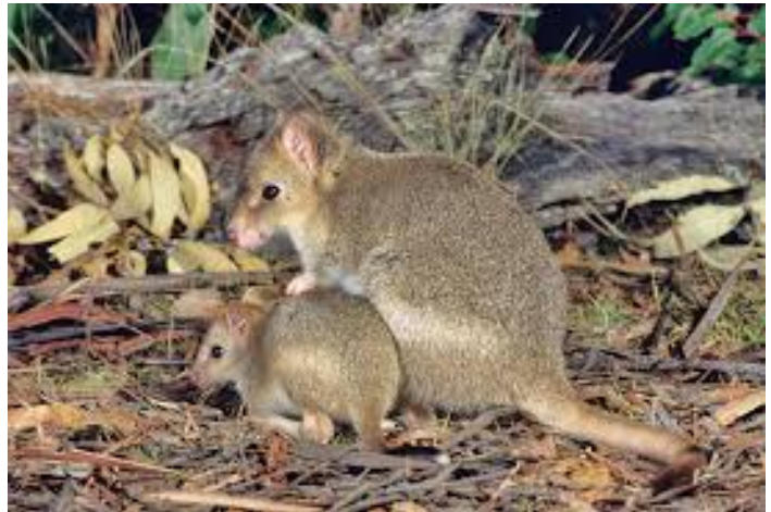
Eastern Bettong

Our analysis surprisingly showed that what we have been calling a woylie was actually three separate species.